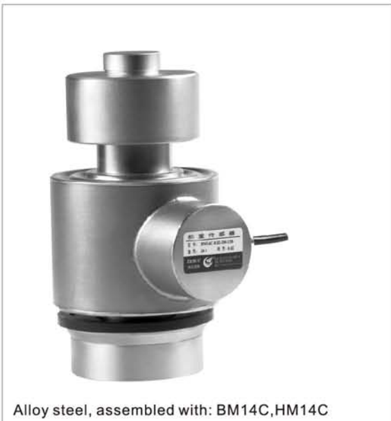
Alloy steel, assembled with: BM14C, HM14C

Easy installation, good self-aligning ability, anti-reversal ability. Mainly used for platform scales, automobile testing facilities, electronic truck scales and other electronic weighing devices.