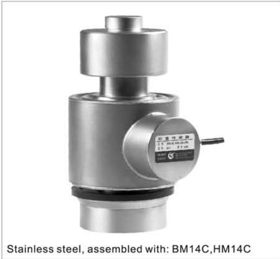
Stainless steel, assembled with: BM14C, HM14C

Easy installation, good self-aligning ability, anti-reversal ability. Stainless steel construction, anti-corrosion, can be used under hazardous environments. Mainly used for platform scales, automobile testing facilities, electronic truck scales and other electronic weighing devices.